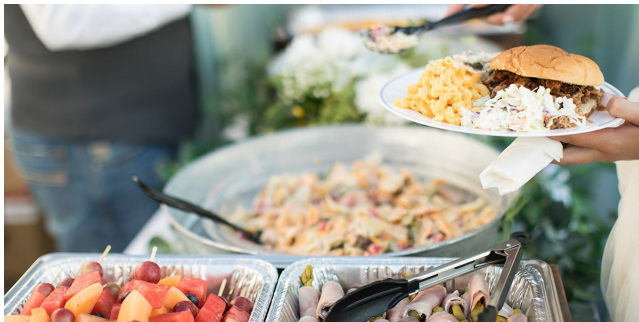
Ripple Center Luncheon Thursday November 13 10:30 am — 2 pm @ Olivet UMC