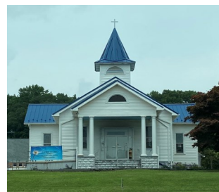
St. Paul UMC