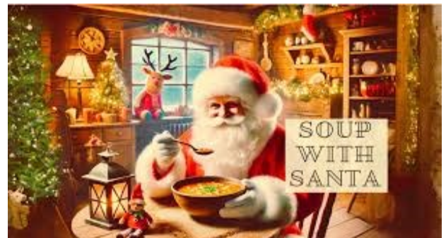
Saturday December 13 10:30 am— 1:30 pm @ Olivet UMC